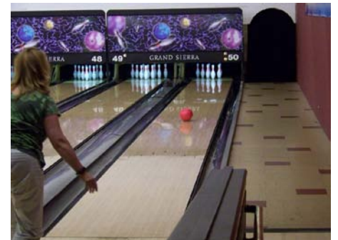
The Washington Chapter bowls (badly) for charity dollars.