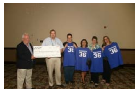
Washington Board members get a BIG welcome as Chapter #36.